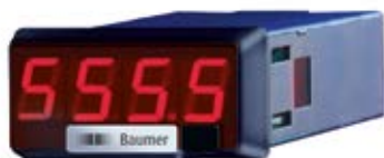
TA1200 - tachometer