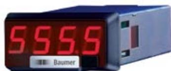
PA201 - Process display