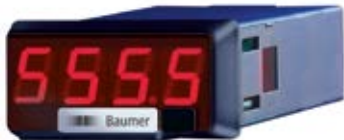
PA200 - Process display